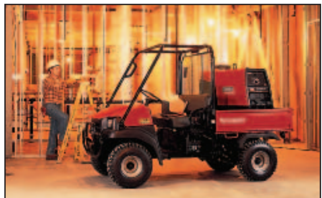
Lincoln Ranger 250 shown with Kawasaki® Mule™ 3000.

The quiet, rugged gasoline-driven Ranger 250 features a lot of welding and auxiliary power in a compact package. Recommended for contractors, construction and maintenance applications, the Ranger 250 is ready for a workout – all day, every day!