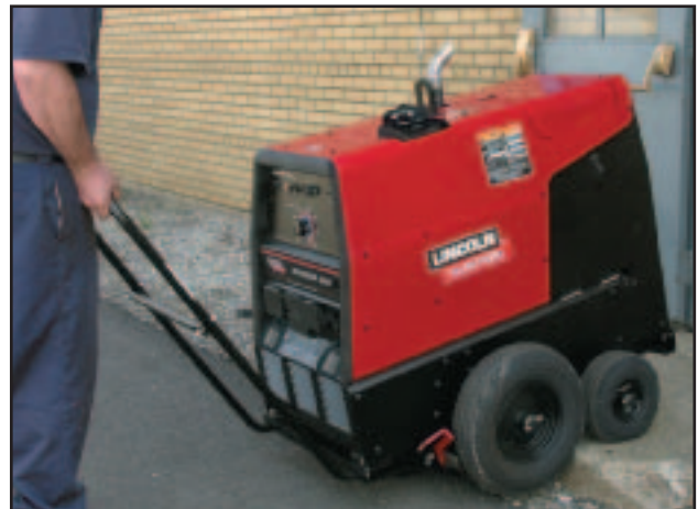
All-terrain undercarriage easily maneuvers over obstacles.